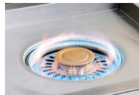
Outer burner adjusts from 5,000 to 45,000 BTU