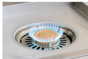
Center burner adjusts from 400 to 20,000 BTU