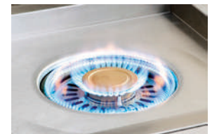
Both burners yield an unprecedented 65,000 BTU