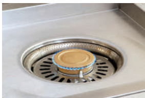
Simmer delicate sauces at a low 400 BTU