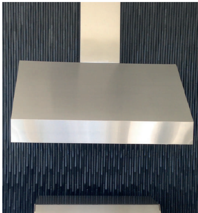
*SHOWN WITH OPTIONAL CUSTOM DUCT COVER